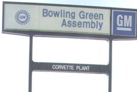
600 Corvette Drive (Exit #28 off I-65)