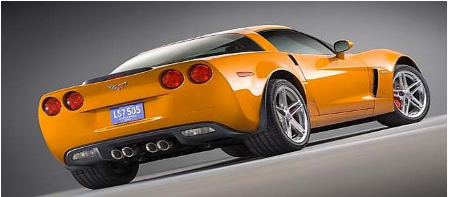
6th Generation Z06 Corvette (High-performance 505 HP) 2005 - present